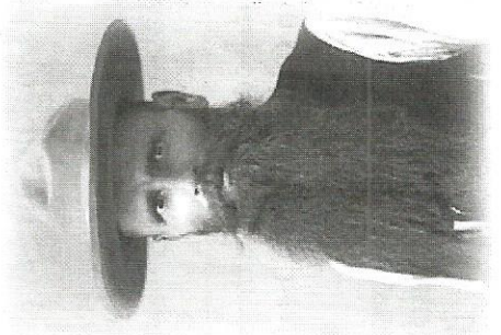
Ft. Hartsuff 2.5 mi. south